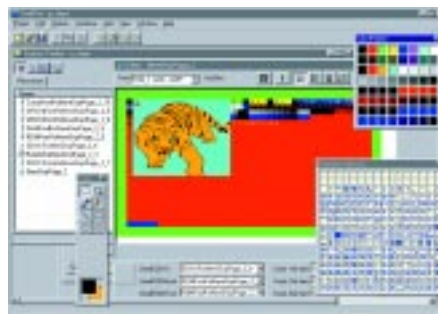
TEDIPRO for Fast & Easy OSD-Development

The SDA 555x is available in samples now and will be ready for mass production from beginning of year 2000 onwards. Please contact your local Infineon Office for further details.