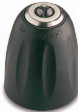
200 SERIES 1 SLEEVE PLASTIC