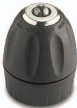
200 SERIES 2 SLEEVE PLASTIC